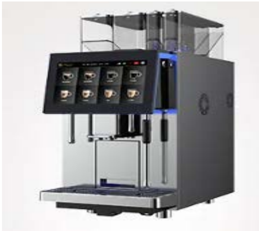
Coffee Taste Custom