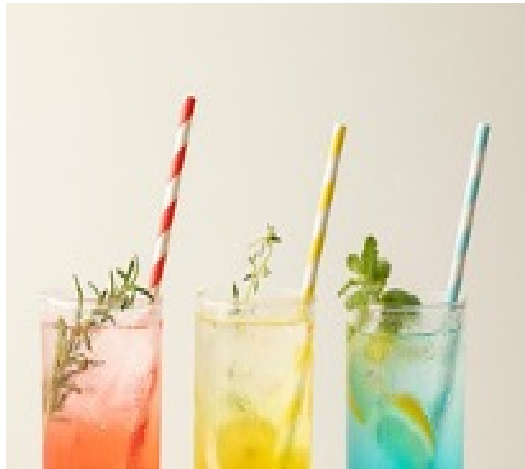
Seasonal Aide+ Tea